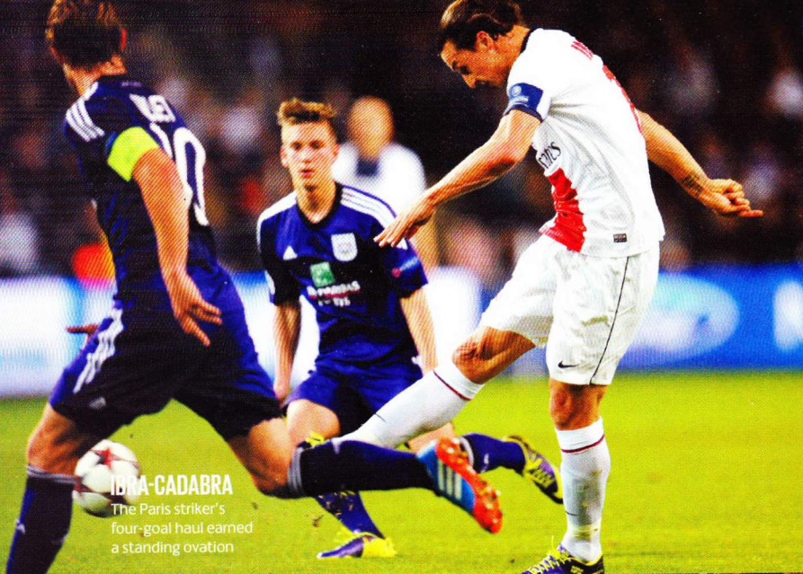
IBRA-CADABRA The Paris striker's four-goal haul earned a standing ovation