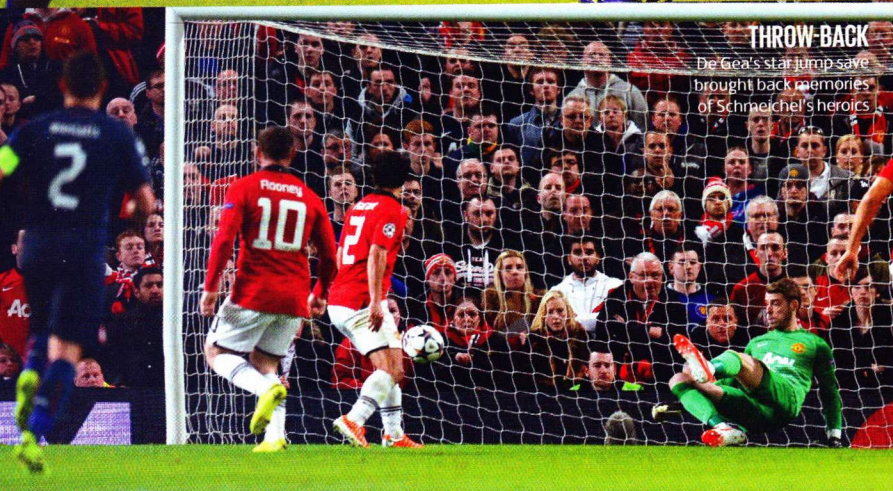
THROW-BACK De Gea's star jump save brought back memories of Schmeichel's heroics